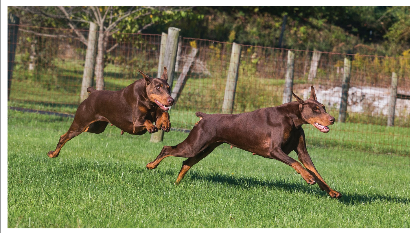
Younger dogs diagnosed with DCM may die suddenly due to ventricular tachycardia or heart arrhythmia in which normal heartbeats are interrupted by rapid beats too close together that short out the heart.

Ventricular tachycardia, a heart rhythm disorder or arrhythmia, occurs in about 25 to 33 percent of Dobermans causing sudden death. This type of DCM occurs in younger dogs in which their normal heartbeats are interrupted by rapid beats that are too close together, subsequently shorting out the heart. About one-third of dogs with ventricular tachycardia have no prior signs of the disease until they die suddenly.