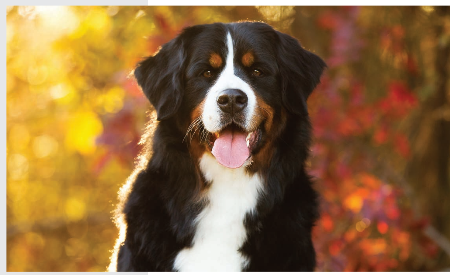
Bernese Mountain Dog

The Bernese Mountain Dog Club of America (BMDCA) has focused on promoting breed health since its