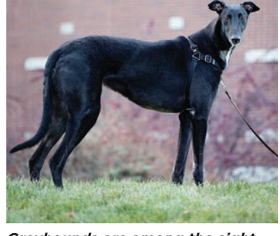
Greyhounds are among the sighthound breeds with a genetic mutation that causes a slow recovery from anesthetic drugs.

The AKC Canine Health Foundation provided funding of $219,026 for this study, which began in February 2018 and will continue through January 2021.