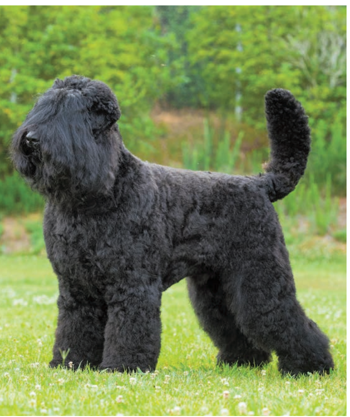
Rottweilers and Black Russian Terriers carry the exact same mutation for juvenile-onset laryngeal paralysis and polyneuropathy, indicating that the mutation likely occurred in a dog ancestral to the formation of both breeds.