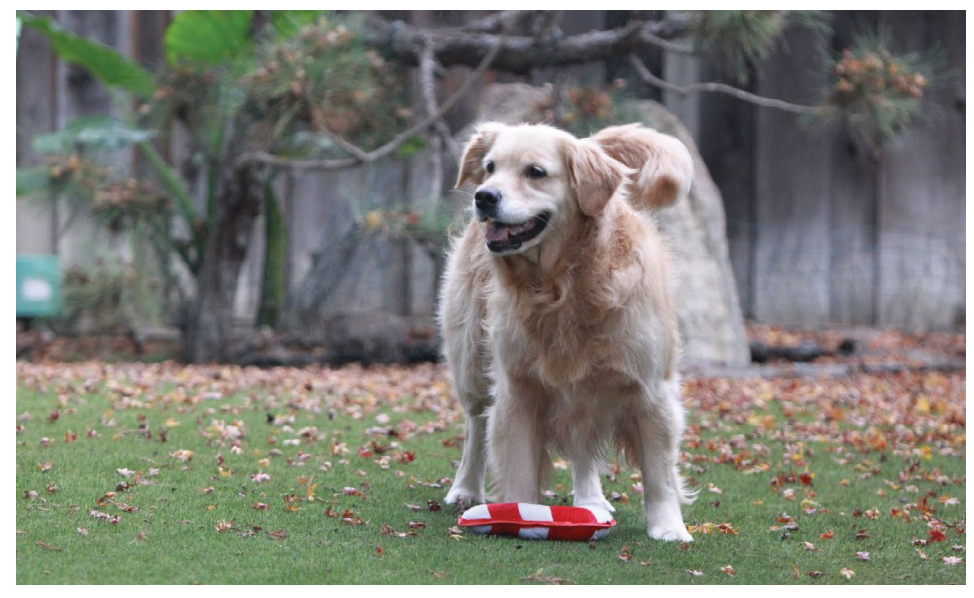
"Brix" (GCH Saffron Cuvee Royale BN RN TD MH DDHF), almost 9 years old, the first Golden Retriever bitch to earn Grand Champion and Master Hunter titles, suffers from allergies that are managed with veterinary care using dermatological medications and lotions.