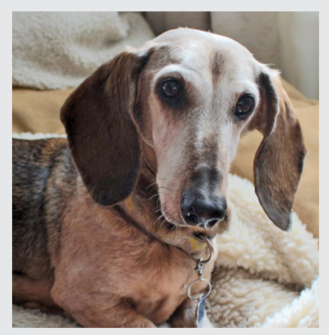
"Bonnie" (Tealdachs Sailor's Delight) was diagnosed with intervertebral disc disease (IVDD) at age 4 and recovered partially with treatment. Her dam was diagnosed with IVDD after producing the litter.

"Caring for a paralyzed dog is emotionally, financially and physically draining."