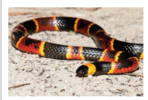
Eastern coral snake

The pit viper snakes are the ones that dog owners should be aware of and most concerned about. The term "pit viper" derives from the prominent pitlike cavity located between these snakes' eyes and