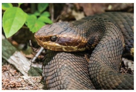
Water moccasin (cottonmouth)