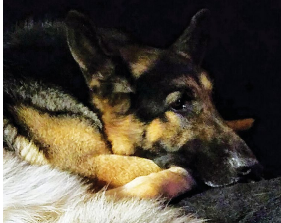
“Tuffy” (CH Rosewood’s Man Up), the beloved house dog of breeder-owner Bo Vujoivich, died of bloat in 2019. Time is of an essence when dealing with a dog that has bloated and can quickly turn tragic, she says.

A minimally invasive procedure, gastropexy is recommended to be done prophylactically at a young age, particularly in dogs having a parent, littermate or half-sibling that has bloated.