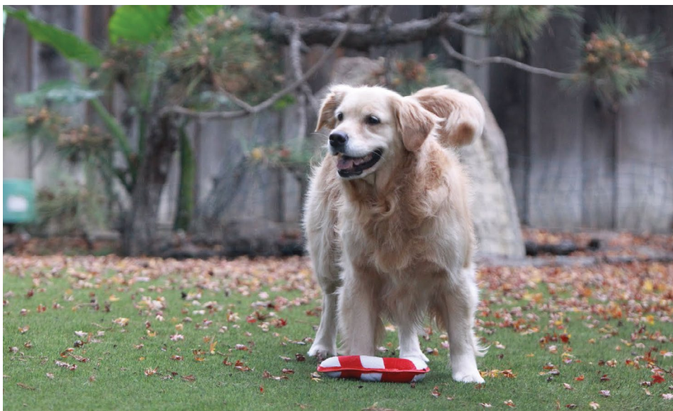
“Brix” (GCH Saffron Cuvee Royale BN RN TD MH DDHF), almost 9 years old, the first Golden Retriever bitch to earn Grand Champion and Master Hunter titles, suffers from allergies that are managed with veterinary care using dermatological medications and lotions.