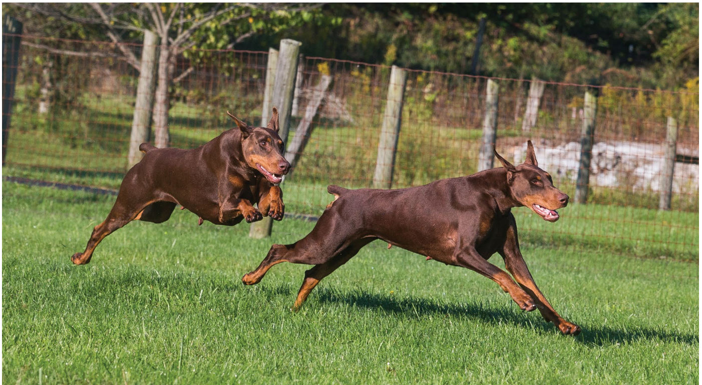
Younger dogs diagnosed with DCM may die suddenly due to ventricular tachycardia or heart arrhythmia in which normal heartbeats are interrupted by rapid beats too close together that short out the heart.

Ventricular tachycardia, a heart rhythm disorder or arrhythmia, occurs in about 25 to 33 percent of Dobermans causing sudden death. This type of DCM occurs in younger dogs in which their normal heartbeats are interrupted by rapid beats that are too close together, subsequently shorting out the heart. About one-third of dogs with ventricular tachycardia have no prior signs of the disease until they die suddenly.