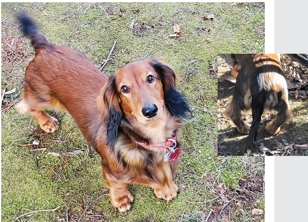
“Parker,” a 9-month-old male Longhaired Dachshund, is having surgery to correct bilateral pes varus. The inset photo shows the bowlegged appearance of his rear legs that will be straightened during the surgical procedure.