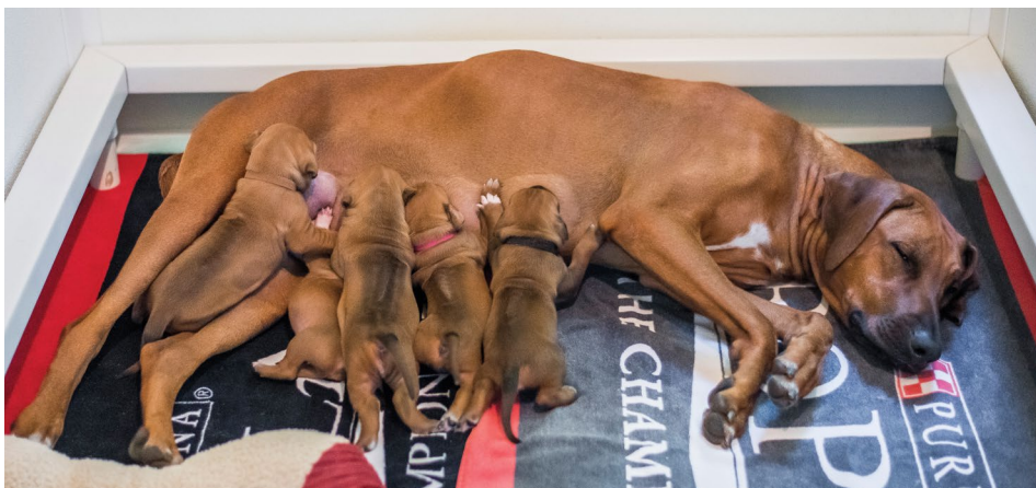
A Rhodesian Ridgeback dam with her puppies in the kennel's whelping room.

hot Florida, giving them an edge on what it takes to beat the heat.