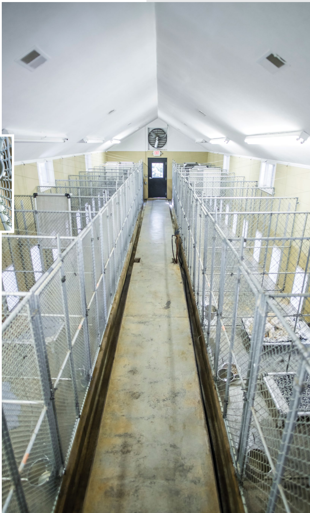
The 13-foot-tall ceiling and windows on both walls of the dog kennel room help to keep the air from the exhaust fan circulating, providing a cool, comfortable environment. Inset photo: Individual water buckets allow for monitoring water intake.

Morning Kennel Cleaning: Turning dogs out into the exercise yards to air out is a priority every morning. This allows the kennel runs to be cleaned without the dogs in them. First, feces are picked up. Since dog stool does not quickly degrade, it is not hosed into the septic system.